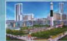
NEW AREA SURROUNDING THE LIGHTHOUSE