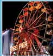
THE FAMOUS STEEL PIER