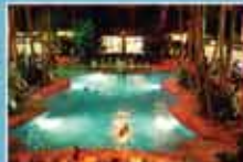
THE POOL AT HARRAH'S CASINO