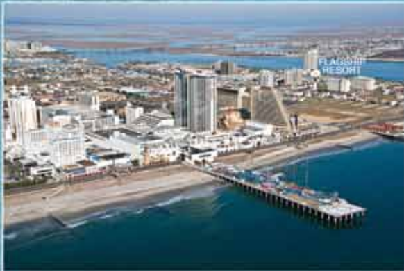
ATLANTIC CITY SKYLINE