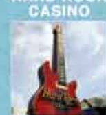
HARD ROCK CASINO