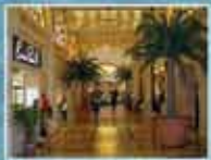
THE QUARTER AT THE TROPICANA