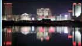
ATLANTIC CITY CASINOS