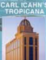
CARL ICANH'S TROPICANA