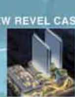
NEW REVEL CASINO