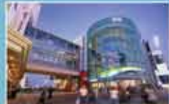
THE PIER SHOPS ON THE BOARDWALK