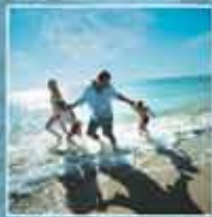
FUN ON THE BEACH