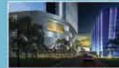
NEW REVEL CASINO