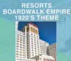
RESORTS BOARDWALK EMPIRE 1920'S THEME