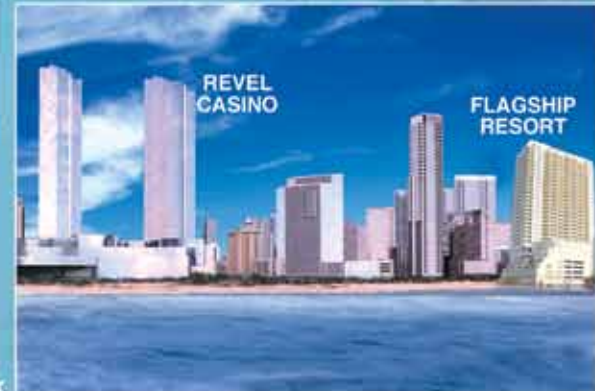
THE NEW BOARDWALK STARTS AT FLAGSHIP RESORT... JUST STEPS AWAY FROM THE NEW REVEL CASINO, SHOPPING & CASINO NIGHT LIFE