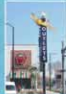
AC OUTLETS, THE WALK